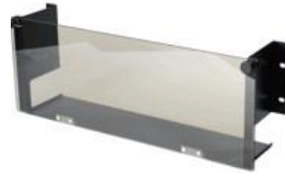
Protective panel MP3558