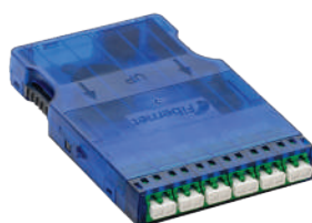
Fiber optics Module