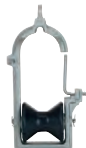
Cable Block 18403060

Fit Overlash Cable Blocks over an existing cable bundle up to 2.75" (70 mm) in diameter and support one 1.25" (32 mm) diameter cable or innerduct. Built-in cable retention system allows placement and removal from ground. Frames are durable cast aluminum with steel inserts on strand contact surfaces. Rollers are rubber or aluminum.