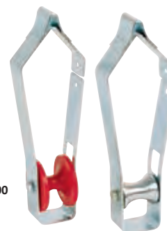
Cable Block 18151500

Due to heat generated by poly-blend rope during pulling operations, an aluminum roller should be utilized. With cotton ropes or pull tape, plastic rollers are adequate.