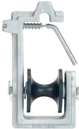
Cable Block 18401060

Due to heat generated by poly-blend rope during pulling operations, an aluminum roller should be utilized. With cotton ropes or pull tape, plastic rollers are adequate.