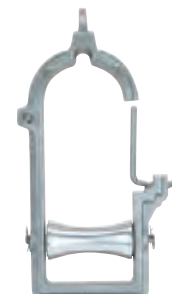
Cable Block 18401180