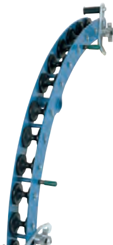
90° Corner Cable Block 18101940