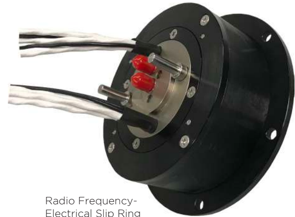
Radio Frequency- Electrical Slip Ring

Radio frequency rotary joints are used to transmit signals between stationary and rotating radar and other systems. RF rotary joints with 1 or 2 channels and with 0 to 50 GHz frequency range can be integrated into your custom slip ring application.