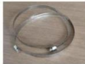
Metal clamp: 2pcs