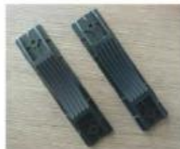
Plastic cross arm: 2pcs